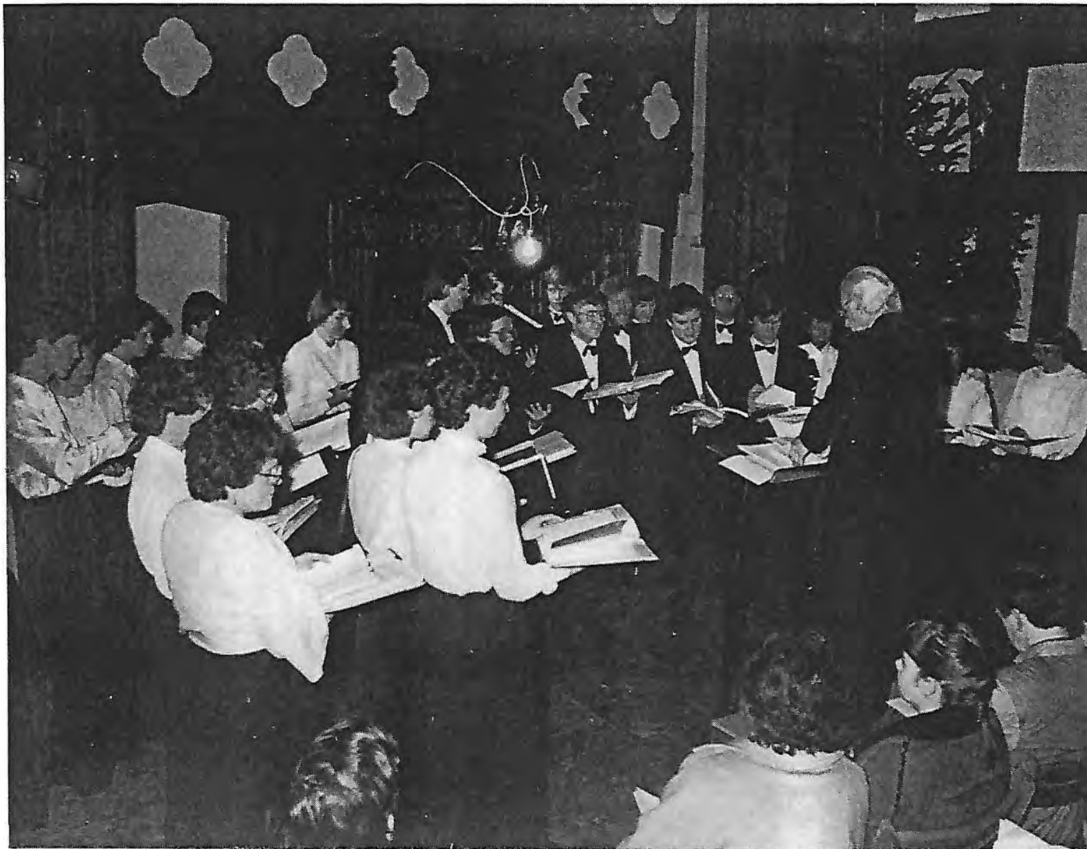
The Capriol Singers give a recital of Christmas music at Rufford Old Hall during their twenty fifth season.