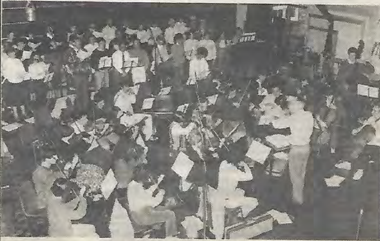
The orchestra and singers.